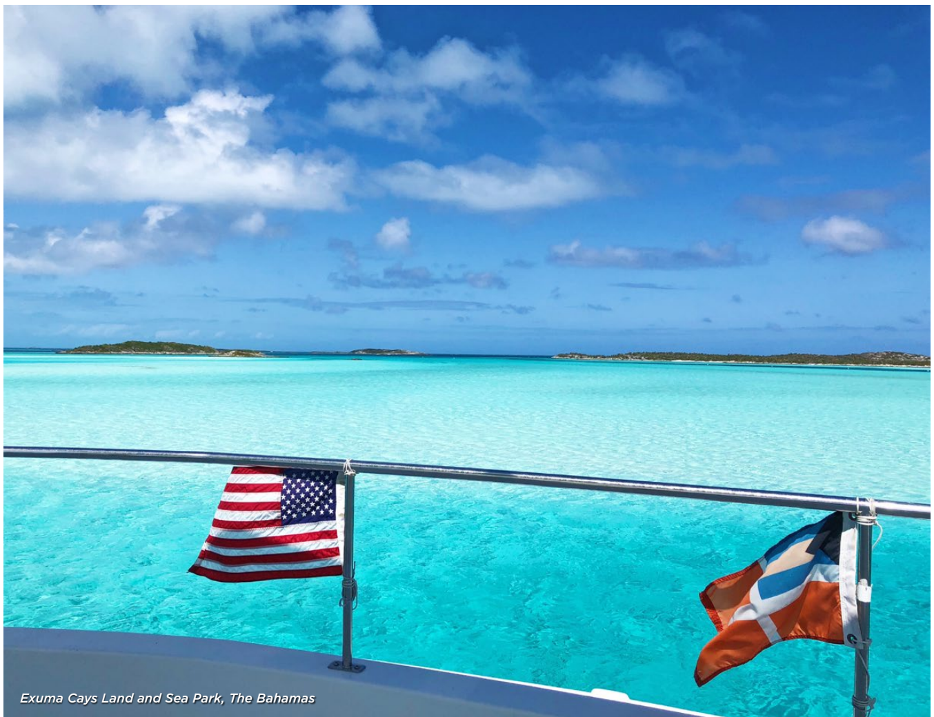
Exuma Cays Land and Sea Park, The Bahamas

SPAIN • BOLIVIA • CRUISING • ANTARCTICA • NEW YORK CITY • BORDEAUX RIVERS